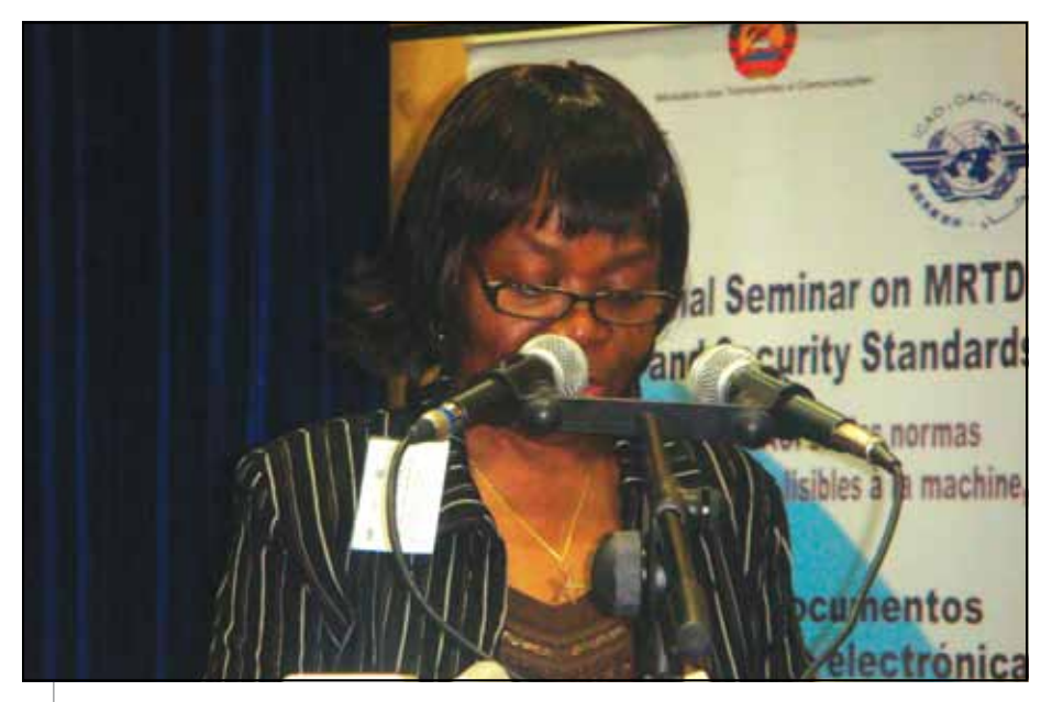
In her opening remarks to the Maputo participants, Folasade Odutola, Director of the ICAO Air Transport Bureau, stressed the emphasis placed by the 37<sup>th</sup> Assembly Declaration on Aviation Security on travel document security, identity management and data sharing as vital components of an effective security strategy.