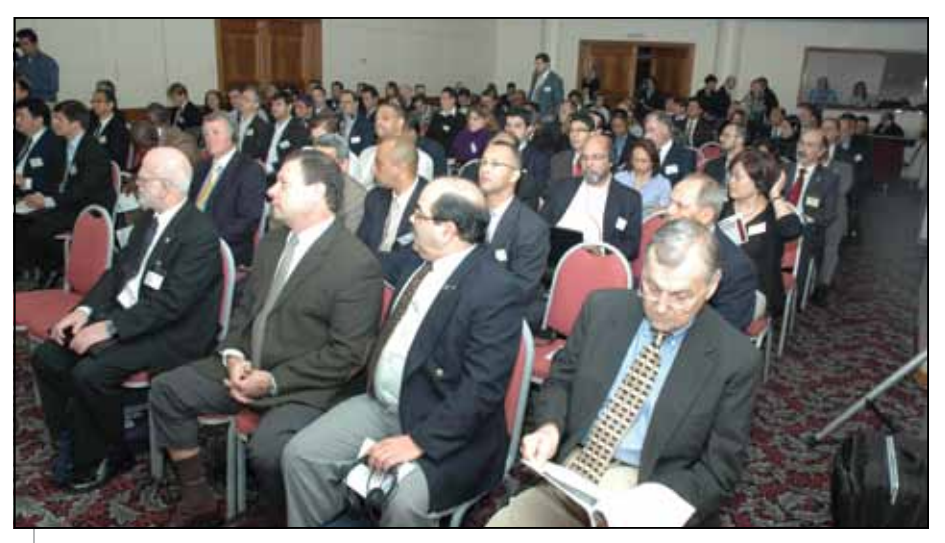
Attendees to the Montevideo Capacity-Building event in the Americas. The main MRTD-related and border security challenges in the region were identified as breeder documents and civil registries, in addition to insufficient inter-agency and cross-border data sharing to prevent and combat identity fraud.

As a compliment to the June Montevideo Workshop, ICAO and the Latin American Civil Aviation Commission (LACAC), with the support of the OAS/CICTE, also held the first ICAO/LACAC Regional Seminar on Machine Readable Travel Documents (MRTDs), Biometrics and Security Standards for the Americas, in Montevideo the following month. The event was attended by over 160 participants from 28 States, mainly those local to the region, but with additional participants in attendance from Africa and Asia.