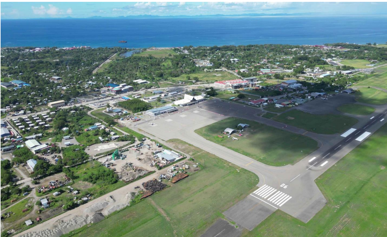
Figure 1. Honiara International Airport

This action plan is a living document, subject to continual evaluation and updates in accordance with the ICAO Assembly Resolution A41-21: Consolidated statement of continuing ICAO policies and practices related to environmental protection - Climate change. The Solomon Islands remain resolute in its commitment to implementing ICAO's environmental protection programs by promoting greener aviation practices.