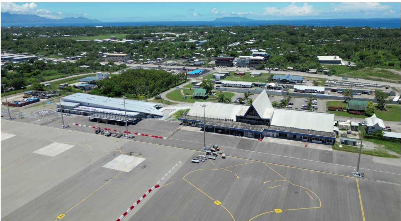
Figure 4. Honiara International Airport